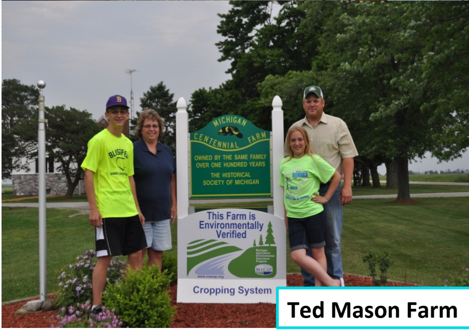
Ted Mason Farm