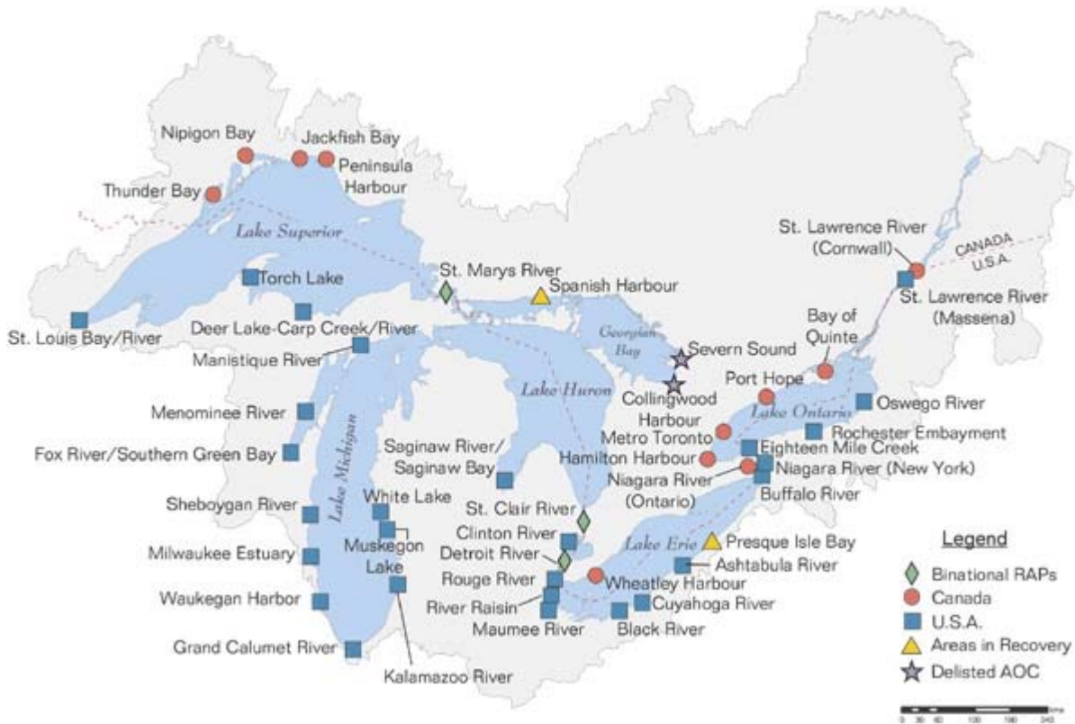
Figure 1: Areas of Concern in the Great Lakes-St. Lawrence River Basin